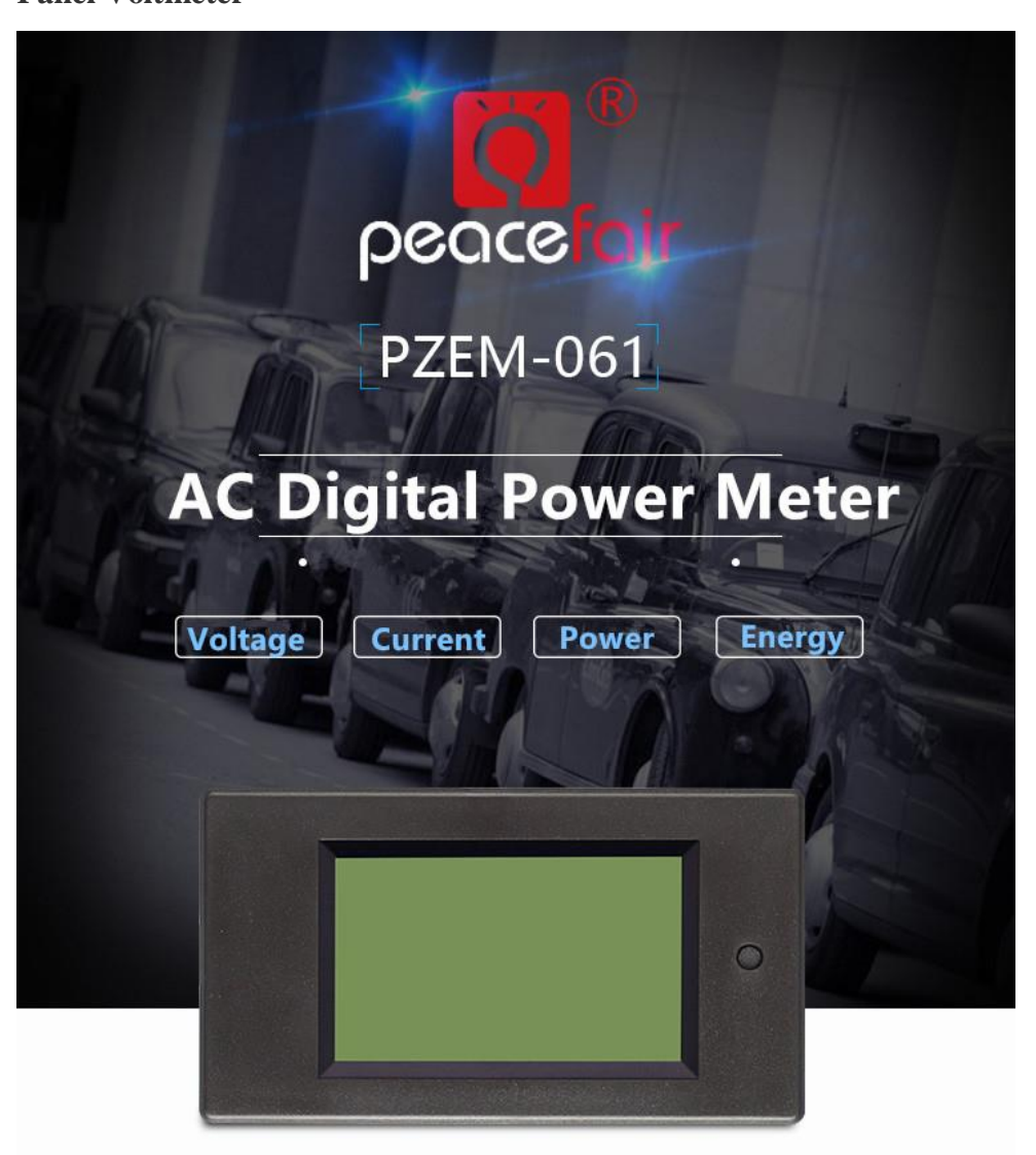
PZEM-061 With Split CT Single Phase 80-260V 100A 4in1 Digital Energy Meter LCD Display Panel Voltmeter